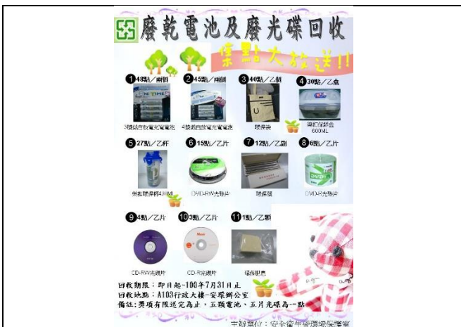
The Waste dry batteries recycle project