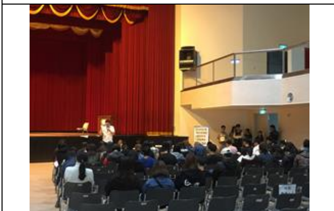
The propaganda of resource recycle