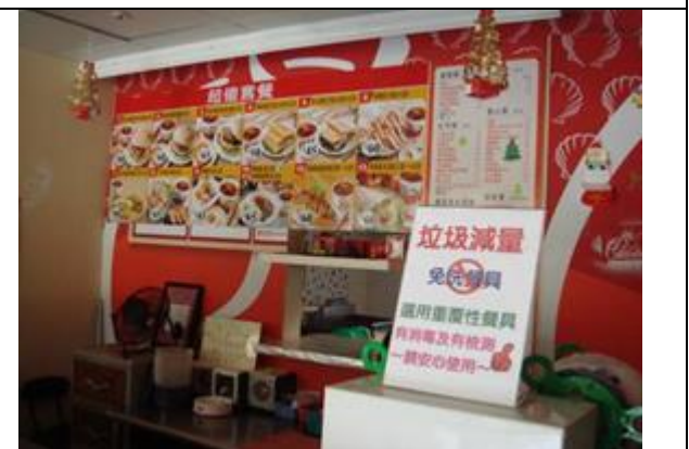
Disposable utensils banned in school's restaurant