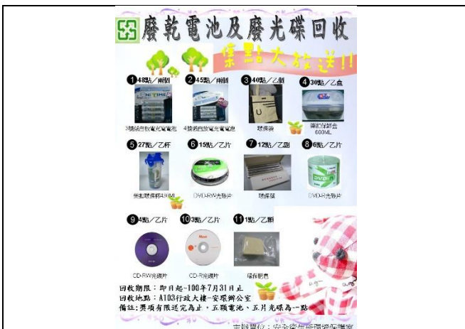
The Waste dry batteries recycle project